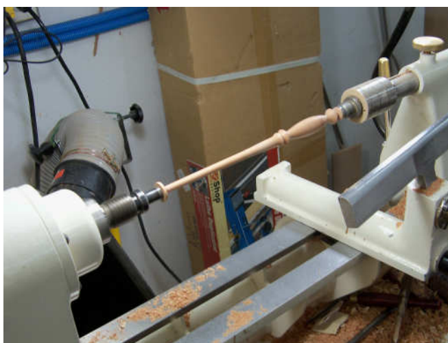
A magic wand

If you're interested in turning a magic wand, here's a link to a short tutorial from Craft Supplies USA: