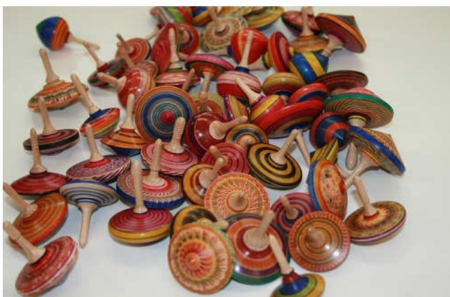
Tops turned by Terry Quiram for the summer reading program at the local library.