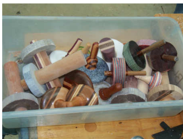
Box of top blanks ready to turn